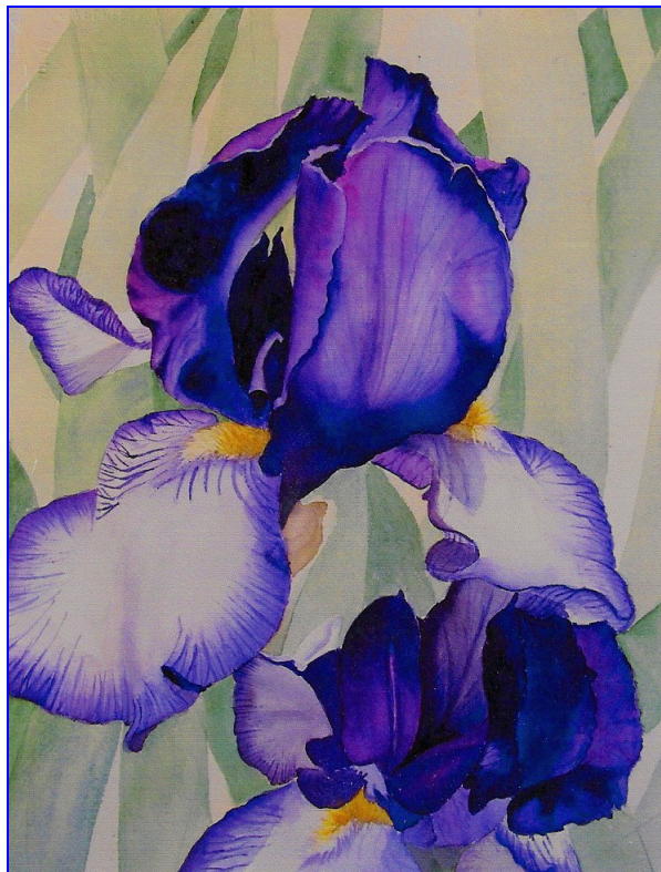
"Purple & White Iris" Watercolor by Deane Locke